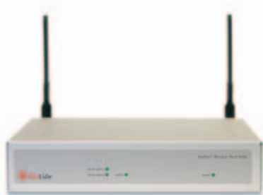
HotPort 6000 Indoor Mesh Node

Designed for seamless indoor and outdoor operation, the HotPort mesh network securely handles concurrent video, voice, and data applications, making it ideal for municipal, public safety, and industrial networks. The mesh's self-forming and self-healing properties enable rapid deployment and dependable operation. FireTide's AutoMesh™ routing protocol manages network load and traffic congestion to optimize mesh-wide performance and capacity.