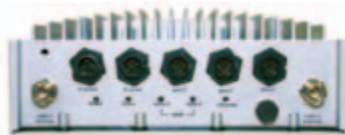
Outdoor HotPort 6000 connectors