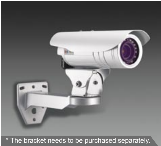
* The bracket needs to be purchased separately.